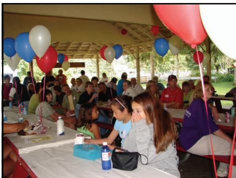
Above: ATI holds the ADA 17th Anniversary Picnic at Suggett Park on 07/27.