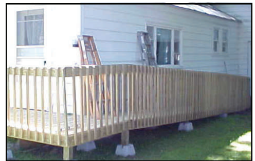
Above: Before and after pictures of a recently completed Access to Home project in Cortland County. Residents now have independence to get in and out of their house.