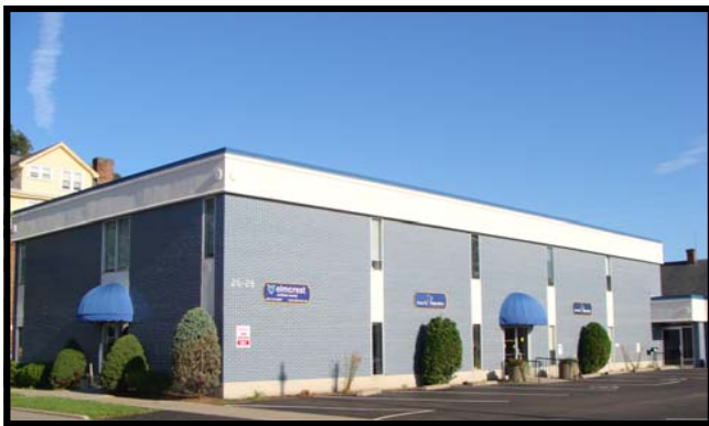
ATI is centrally located at 26 North Main Street In downtown Cortland, New York.

Access to Independence believes that all people with disabilities have the right to control their own lives, make their own decisions and to participate fully in society.